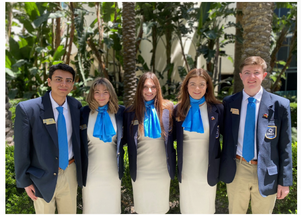
DECA State Officers - Team 68